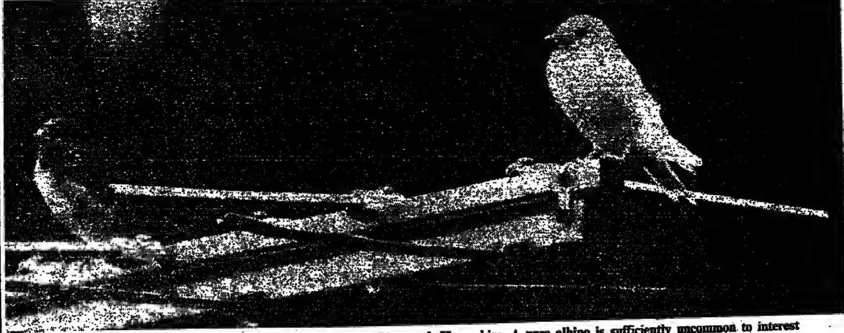
Rare bird: A young white swallow in a barn at a farm near Ringwood, Hampshire. A pure albino is sufficiently uncommon to interest ornithologists. The Royal Society for Protection of Birds says that there are no accurate statistics, but on average, no more than one sighting a year is reported. Birds with whole or part white plumage tend to be mobbed by their fellows and are conspicuous targets for birds of prey.

As inflation continues, it is not just the usual objects of art that rise in value, but also early scientific instruments. Microscopes, barometers, quadrant and nocturnal instruments, becoming excellent investments for the connoisseur. But they are also tempting forgers to imitate them.